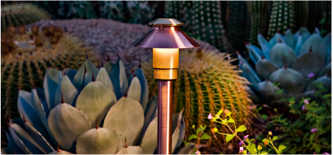
Application picture shown as ZION-PL-4-G4-CU-F (not in Amber).