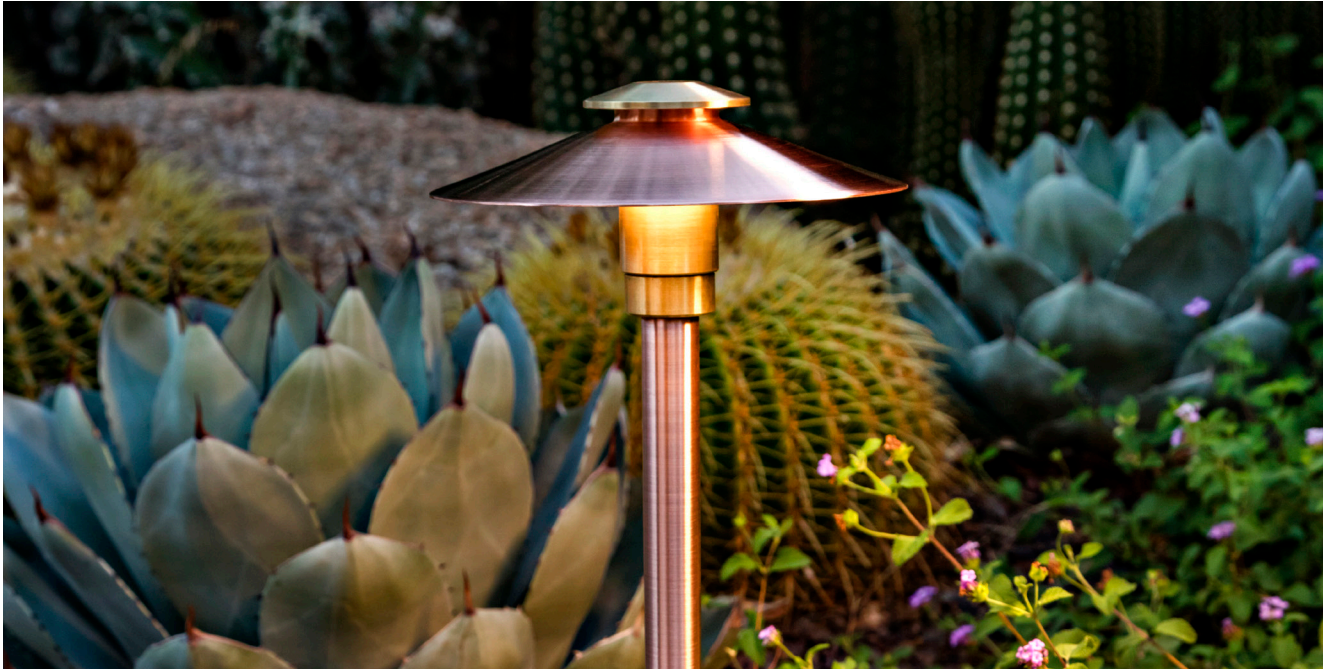
Application picture shown as SEQUOIA-PL-7-G4-CU-F (not in Amber).