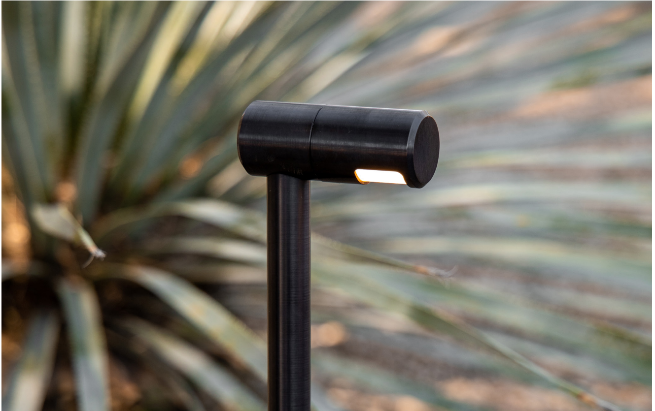
Application picture shown as REDWOOD-PL-G4-BR-BLK-18-BR-BLK-STEM-NL (not in Amber).