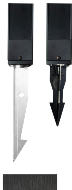
Black Powder Coated Aluminum