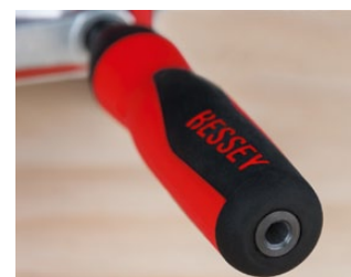
6 mm steel socket screw for applying force with a hex key or driver