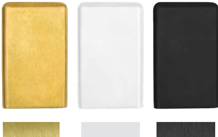
Brass (BR) White (WH) Black Brass (BR-BLK)