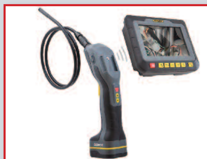
Detachable wireless console features 33 ft. (10m) range