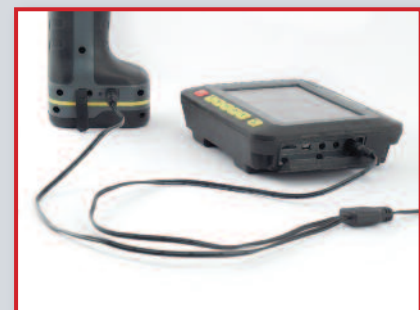
Charge console and grip at the same time