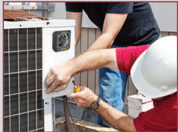
Strong magnetic back and wireless connectivity make this scope ideal for HVAC/R inspections

1 Yr. Limited Warranty An Garantie limitée Año Garantía limitada