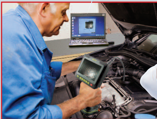
The 9mm (0.35 in.) diameter probe can navigate crowded engine compartments