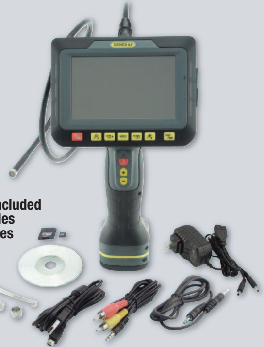
Shown with included software, cables and accessories

Pistol Grip w/ Brightness Controls, Activation Trigger, and Tripod Mount, Detachable Monitor w/ LCD, 128MB Flash Memory, Magnetic Back, Microphone, Speaker and Tripod Mount, 9mm (0.35 in.) dia. x 1m (39 in.) Long Camera-tipped Probe, AC Adaptor with 2-in-1 Charging Cable, 2GB MicroSD Card, USB PC Interface Cable, ScopeView PC Interface/Media Management Software on Mini-disc, Signal Cable for connecting Grip and Monitor, A/V Cable for connecting to TV Monitor, Four Probe Tip Accessories (45° Mirror, Magnetic Pickup, Pickup Hook, Thread), Custom Hard Plastic Carrying Case, User's Manual, Warranty